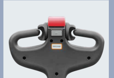
The upright-tiller running function allows it to work within confined space, such as container