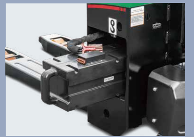
Easy for exchanging battery