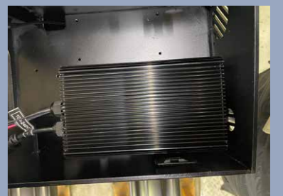
Built-in charger, charging is more convenient