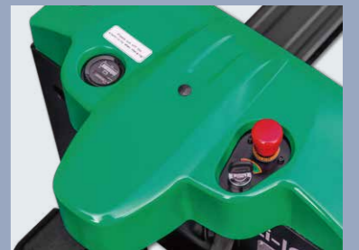
Body feature smooth lines and affluent sense of movement, and compact profile, in accord with the latest appearance design trend